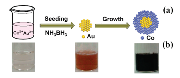
Figure 1. (a) Schematic illustration, (b) color evolution in the formation process of Au@Co core-shell NPs via a one-step seeding-growth method at room temperature.

The synthesis progress can be visibly monitored by the evolution of the solution color (Figure 1b). Once the aqueous solution of HAuCl<sub>4</sub> and CoCl<sub>2</sub> with a molar ratio of 0.06:0.94 in the presence of polyvinylpyrrolidone K 30 (PVP, 1 wt %) as the stabilizing agent is mixed with the AB solid,<sup>8</sup> the color of the mixture suddenly changes from its light-pink color to orange-red in a few seconds, indicating Au<sup>3+</sup> cations are preferentially reduced to Au<sup>0</sup> NPs prior to Co<sup>2+</sup> cations. Then the color became darker and darker and finally changed to pure black within 2 min. Based on this color evolution and their intrinsic difference in reduction potentials, we can reasonably assume that the obtained particles are in the core—shell architecture.